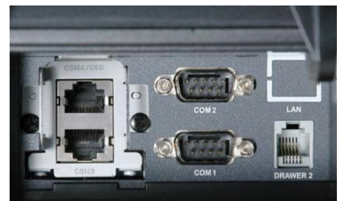
Up to 4 RS-232C Ports Hidden Behind a Convenient, Easy to Access Door