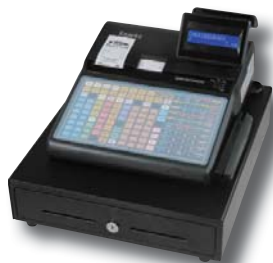
ER-940 Flat Spill-Resistant Keyboard; Receipt And Journal Printers