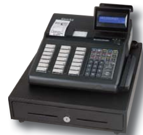
ER-945 Raised-Key Keyboard; Receipt And Journal Printers