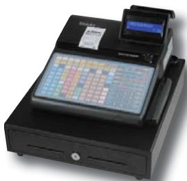
ER-920 Flat Spill-Resistant Keyboard; Receipt Printer