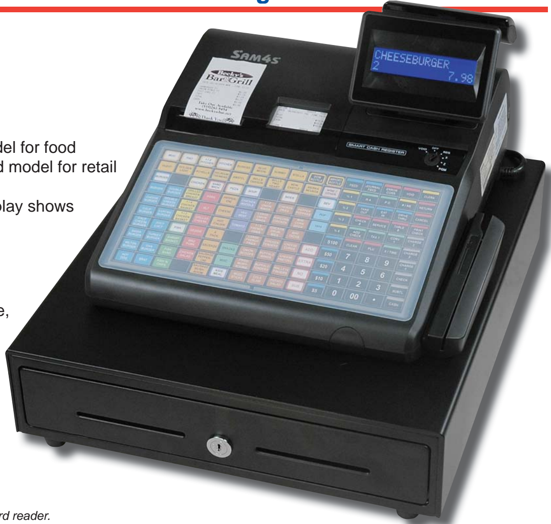
SAM4s ER-940 shown with optional card reader.